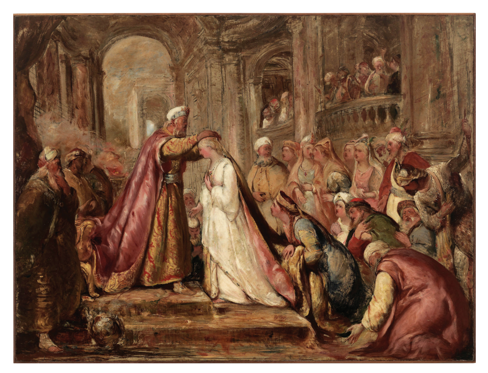
Fig. 1. William Rimmer. The Coronation of Queen Esther , 1847. Oil on panel, 19 ¾ x 26 ¼ in. Mead Art Museum, Amherst College. Gift of Herbert W. Plimpton: The Hollis W. Plimpton, Class of 1915, Memorial Collection.