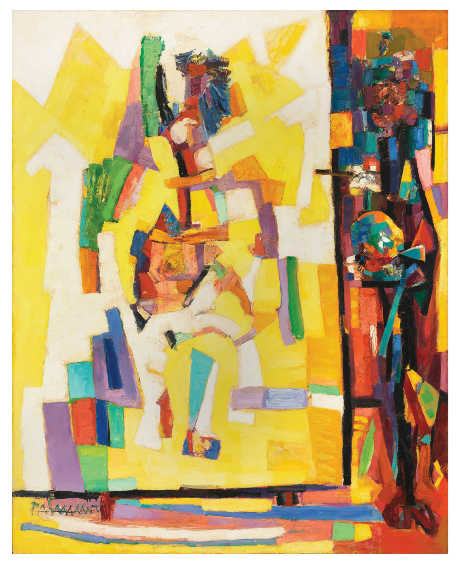
Fig. 4. Abraham Rattner, Song of Esther , 1958. Oil on composition board, 59 15/16 x 48 1/16 in. Whitney Museum of American Art, New York. Purchase, with funds from the Friends of the Whitney Museum of American Art. Inv.: 58:36.