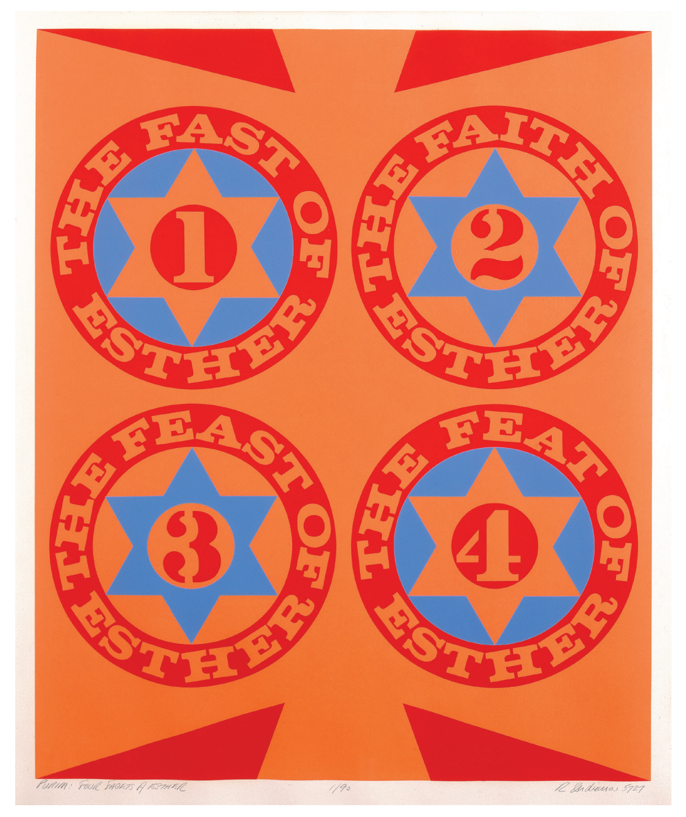
Fig. 6. Robert Indiana, Purim: Four Facets of Esther , 1967. Screen print on paper, 29 7/16 x 23 ½ in. Jewish Museum, New York. Commissioned by The Jewish Museum, JM 109-67. Photo by John Parnell. Photo credit: The Jewish Museum / Art Resource, NY © 2020 Morgan Art Foundation Ltd / Artists Rights Society (ARS), NY